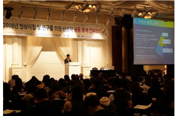
IBS Fall Conference at Seoul