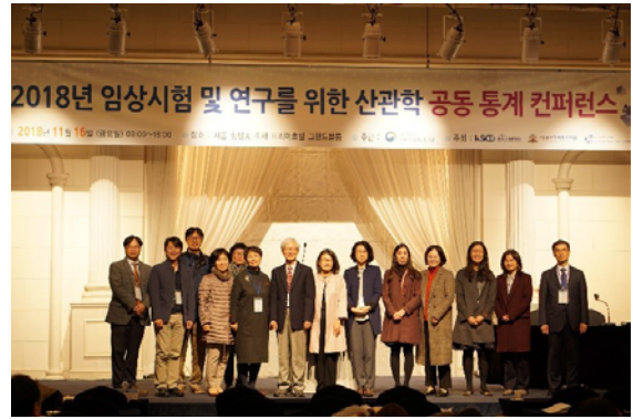
IBS Fall Conference at Seoul